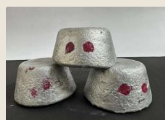
Aluminium Titanium 10%