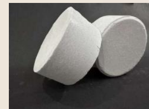
Zinc Refiner Tablet