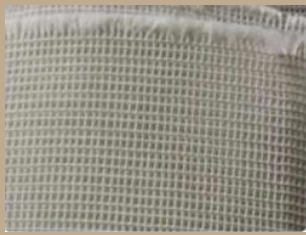
Filter Fabric 400 Mesh