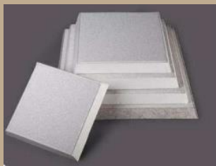
Ceramic Foam Filter