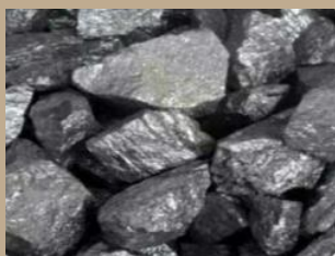
Silicon Metal (441,2202,553)