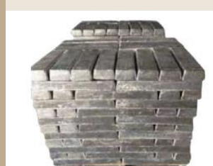
Magnesium 99.99% (Acid Washed)