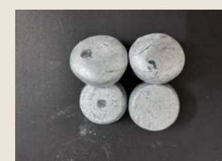
Aluminium Strontium 10%