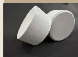
Grain Refiner Tablets