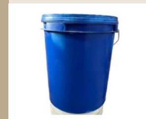
DYKOTE - 11